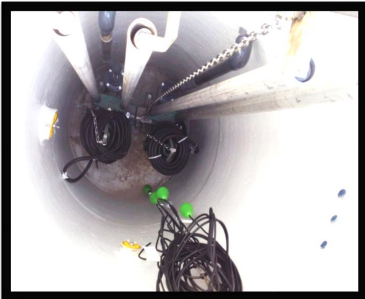
Photo 2: Shows the plug and check valves with support brackets each side.